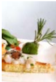
FIG & OLIVE LUNCH DESSERTS

Plater of Homemade Fig & Walnut Biscotti and Honey-Lavender Madeleines 4-5 people 8-10 people