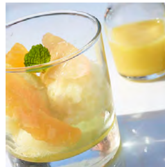
FIG & OLIVE

EVENTS & CATERING FIFTH AVENUE, NEW YORK