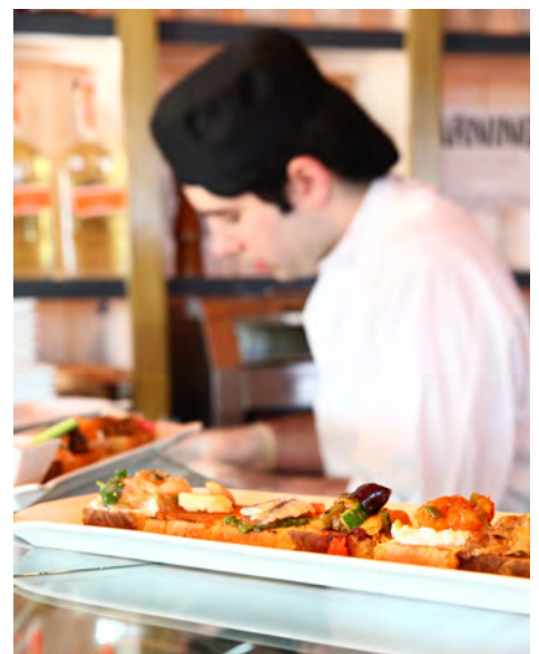
FIG & OLIVE Vernon Hills Shopping Center, 696 White Plains Road, Scarsdale, NY 10583 | 914 725 2900 | figandolive.com