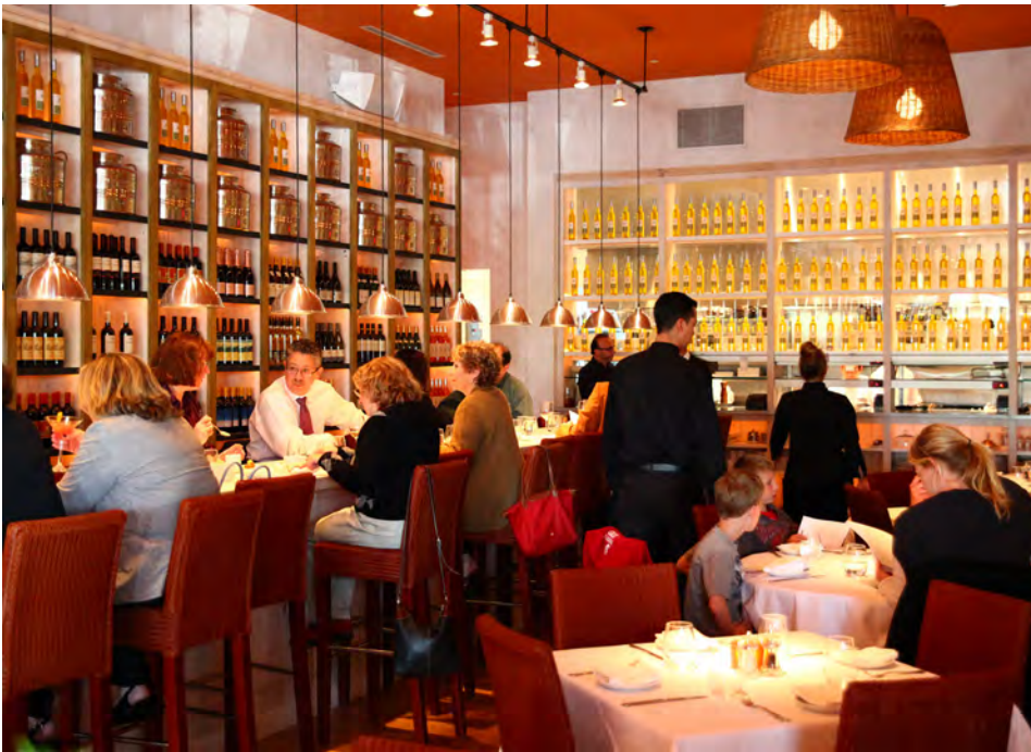
FIG & OLIVE's Westchester location is ideally convenient for local residents and businesses in the area. A spacious, light-filled, 4,000 square foot space opens to the outside sidewalk café. The inside tasting bar and communal table, lounge and dining area are designed with FIG & OLIVE's Mediterranean interior palette – warm, terra cotta-colored ceilings, white stucco walls with a natural limestone wash, hand-woven loom sofas and chairs, hanging basket lamps, and an abundance of fresh rosemary plants and olive trees provide an ideal setting for private parties and events.

The first FIG & OLIVE opened in New York City in 2005 and in 2011 FIG & OLIVE opened two new locations – Melrose Place in West Hollywood and Westchester, New York.