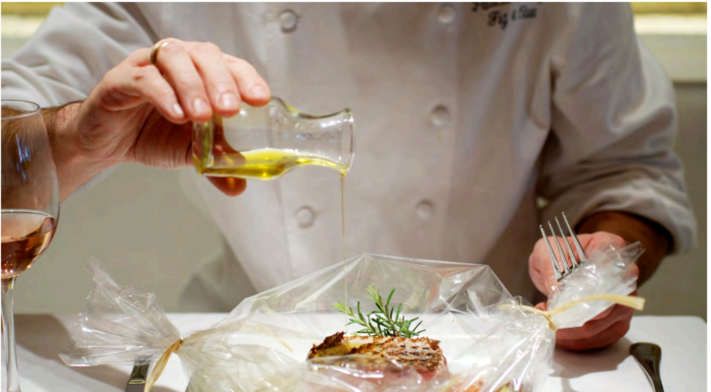
FIG & OLIVE WESTCHESTER, NEW YORK